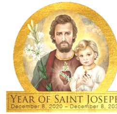
YEAR OF SAINT JOSEPH December 8, 2020 - December 8, 2021

Hail Guardian of the Redeemer, Spouse of the Blessed Virgin Mary. To you God entrusted his only Son; in you Mary placed her trust; with you Christ became man. Blessed Joseph, to us too, show yourself a father and guide us in the path of life. Obtain for us grace, mercy and courage, and defend us from every evil. Amen. Pope Francis, 2020